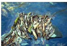
Natural Leaf Pack