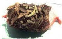
Artificial Leaf Pack

Many benthic macroinvertebrates live in leaf packs. By placing artificial leaf packs and leaving them in the water for 3-4 weeks. These leaf packs are colonized and can be collected and brought back to the school or lab to sort and identify the benthos.